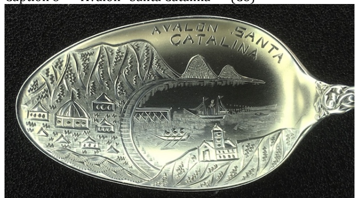
Caption 8 - "Avalon Santa Catalina" (C8)